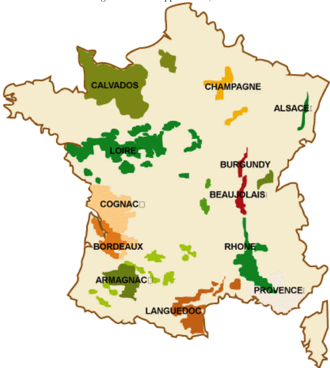
Figure 1: Wine Appellations, France